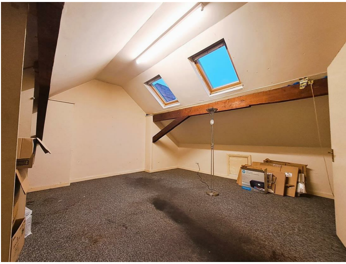
The master bedroom is located on the first floor with two Velux windows, power and light points.